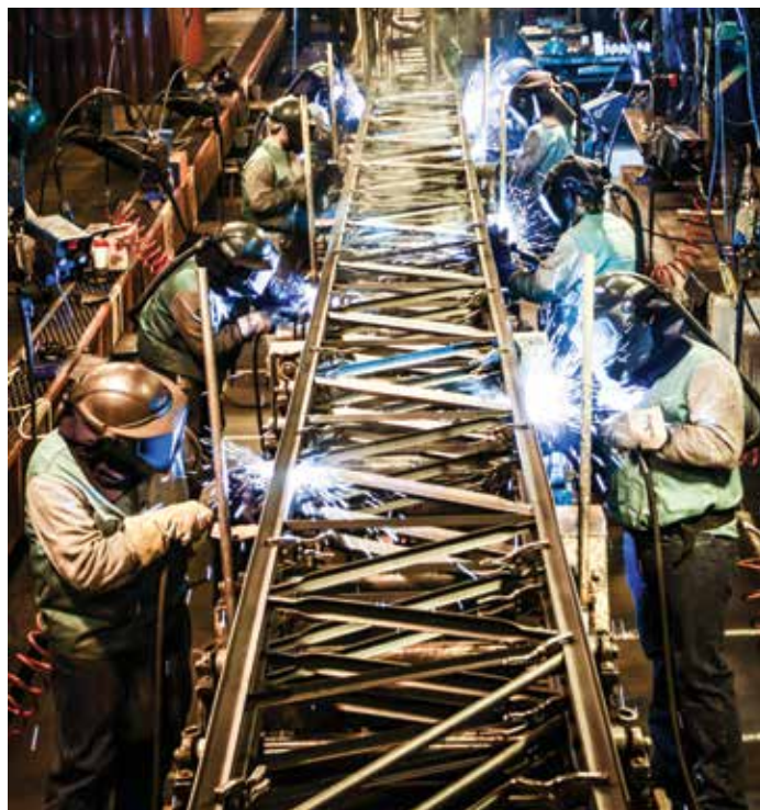
Figure 2. Welding web to chords of an open web steel joist, Vulcraft facility.

The background LCA conducted to obtain the EPD of a given product typically spans only the raw material supply, transportation, and manufacturing life stages, referred to as "cradle-to-gate." Selecting the construction material with the lowest GWP in the EPD does not necessarily correspond to the most sustainable solution for the whole building. In civil structures, other life stages (e.g., maintenance, repair, energy use, demolition, recycling) need to be considered to evaluate