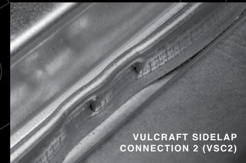
VULCRAFT SIDELAP CONNECTION 2 (VSC2)

CONNECTIONS IN SIDE LAP SEAMS ARE ALWAYS CONSISTENT REGARDLESS OF THE OPERATOR SIZE OR STRENGTH.