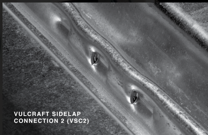
VULCRAFT SIDELAP CONNECTION 2 (VSC2)